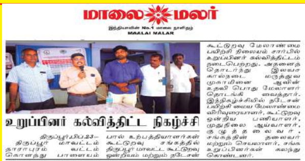
Member Education Programme for Milk Producers Coop. Society at Tiruppur District