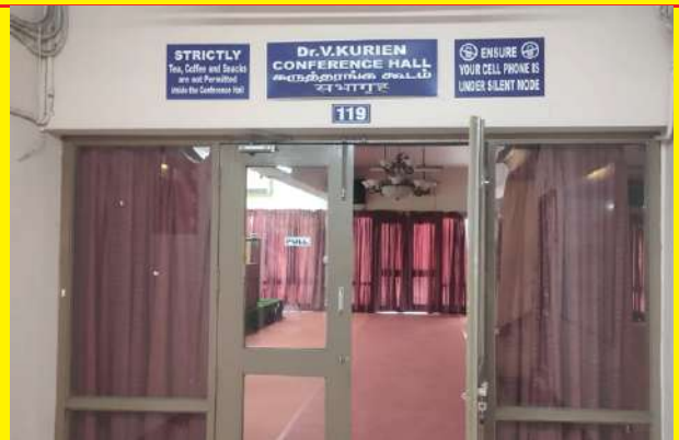
Dr. V. KURIEL CONFERENCE HALL