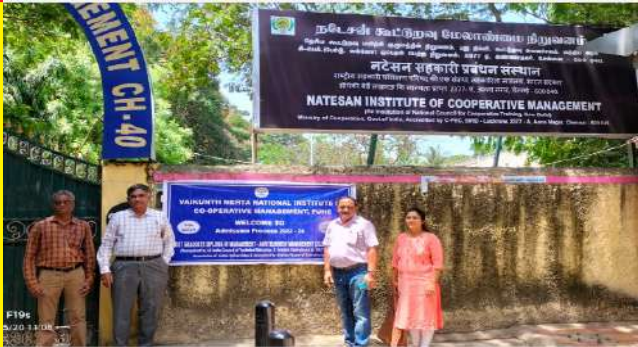
Collaboration with VAMNICOM, Pune PGDM Course Admission