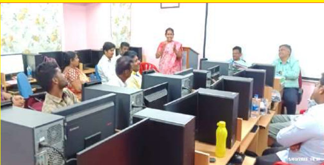
ADVANCED EXCEL TRAINING IN COMPUTER LAB