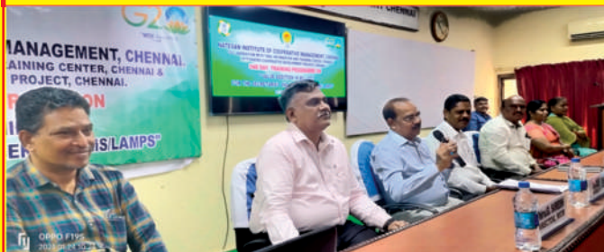
Value Addition in Millets programme conducted for the Secretaries and Managers of CMS/ LAMPs Secretaries