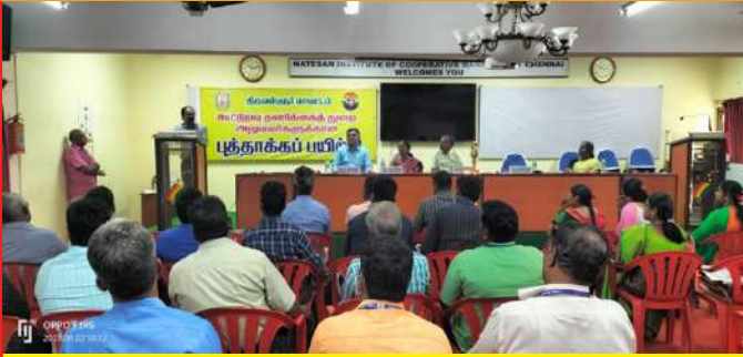
REFRESHER COURSE For The Cooperative Auditors