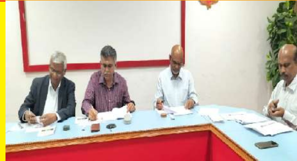
VAMNICOM, Pune-PGDM Admission, GD&P