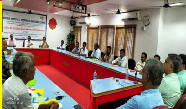
Prog. on "Design Skills and E-Commerce" for Handloom Weavers