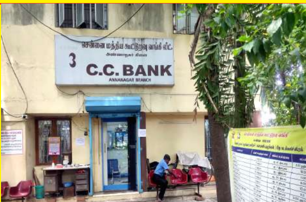
CHENNAI CENTRAL COOPERATIVE BANK