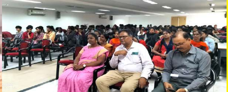
Youth awareness programme on cooperatives conducted for Guru Nanak college students, Chennai.