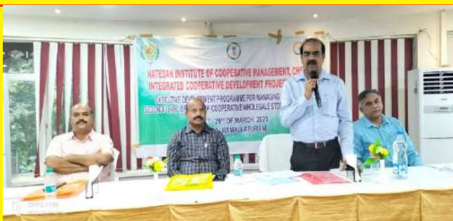
Executive Development Programme for the MDs( JRs/ DRs/CSRs) and officials of Consumer cooperative stores