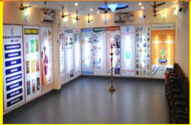
A/C DINING HALL