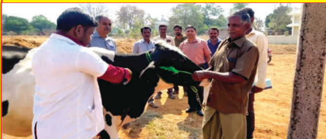
Member Education Programme for Primary Milk Cooperative Society Members- Tiruppur District