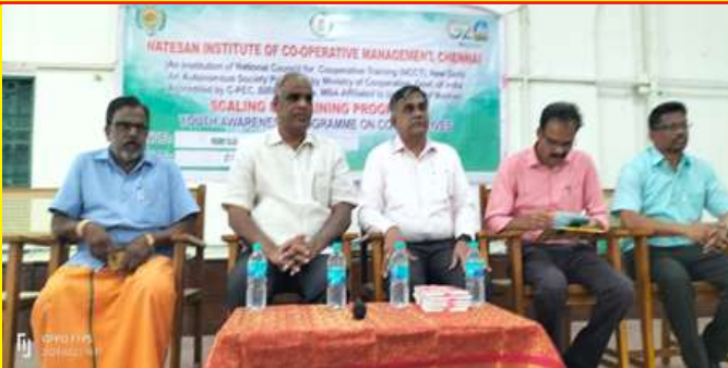
Youth awareness prog. on Cooperatives at Presidency College, Chennai.