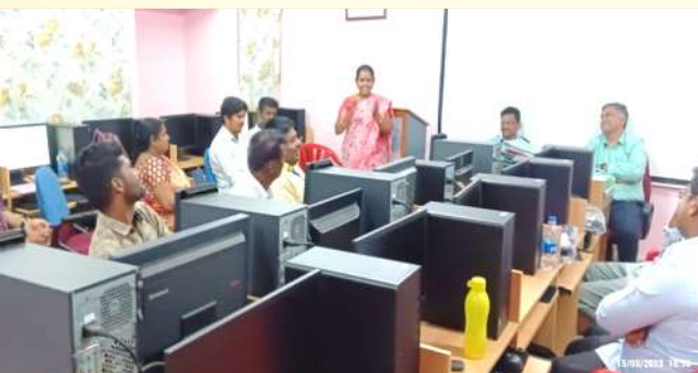
ADVANCED EXCEL TRAINING IN COMPUTER LAB